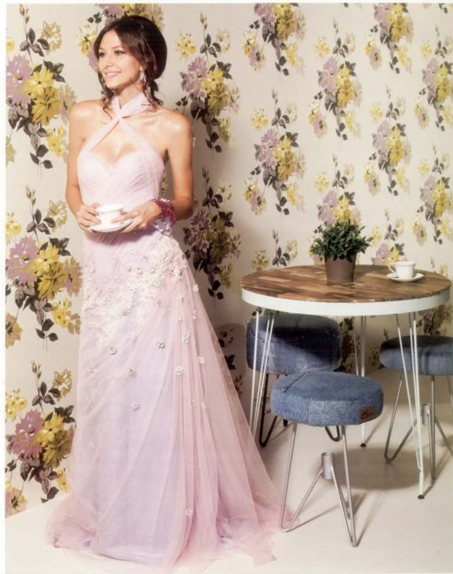
Pretty In Pink. Glamour mint and fuschia earrings, necklace worn on wrist, all from Swarovski. Round table, denim upholstered stools, all from the eco-friendly D-Bodhi range, available at JourneyEast.